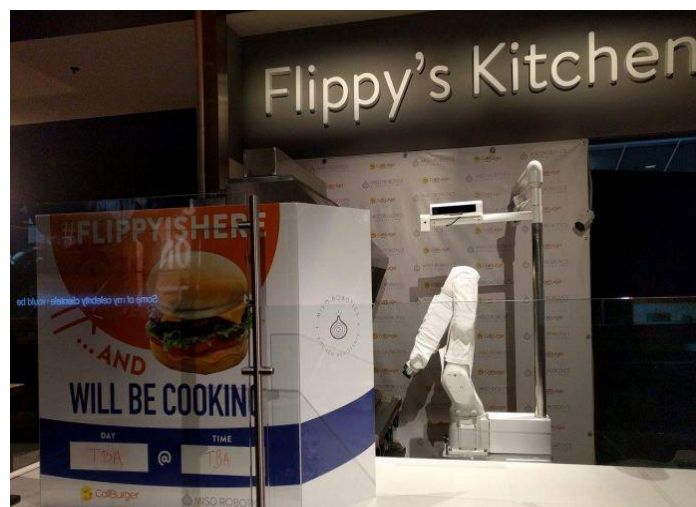
Photo 1: Flippy sits idle in their kitchen.

Flippy, a burger flipping robot made by Miso Electronics, has been taken offline after just a day of work, while the restaurant figures out how to optimally work with the robot.