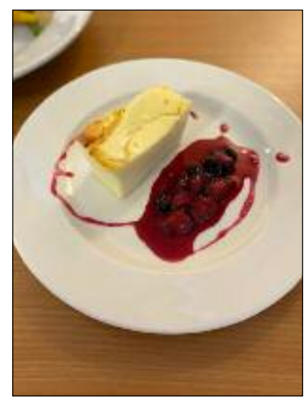
QUALITY FOOD: Daisy prepared a Chicken Roulade and a Basque cheesecake at the Regional Finals.