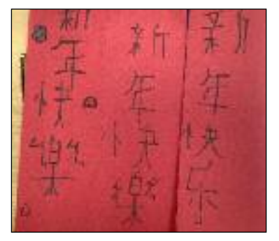
MANDARIN MESSAGES: From Barton School pupils.