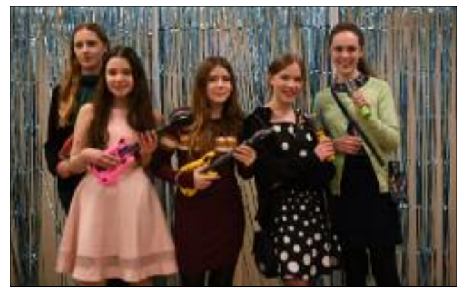
PHOTOBOOTH FUN: Students showcase their outfits and accesorised with inflatable instruments and microphones.