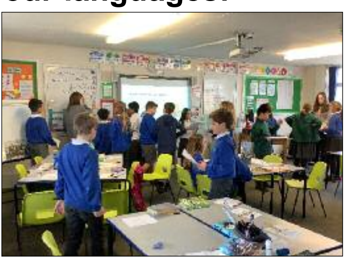
EASTER LESSONS: Comberton students teach primary pupils about the festival in different countries.

They also learned about Pinyin, the system that spells Chines names and words with the Latin alphabet based on their pronunciation. Iln Mandarin it literally means 'spell sound' and can be a really useful took for correctly pronouncing Mandarin words.