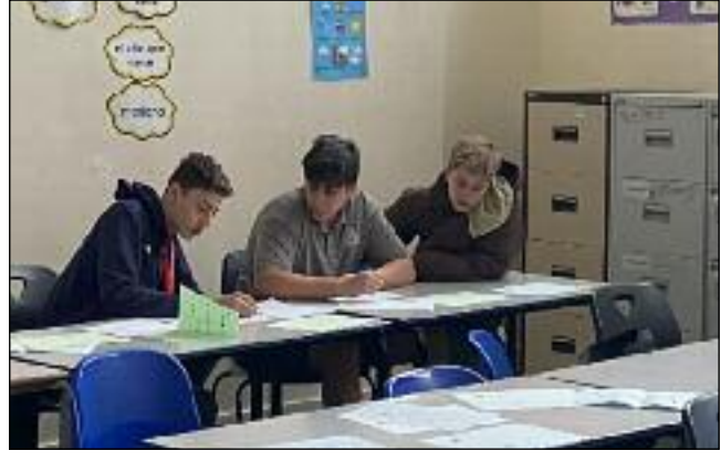
PARTNERSHIP: German and Comberton students work together on a treasure hunt.