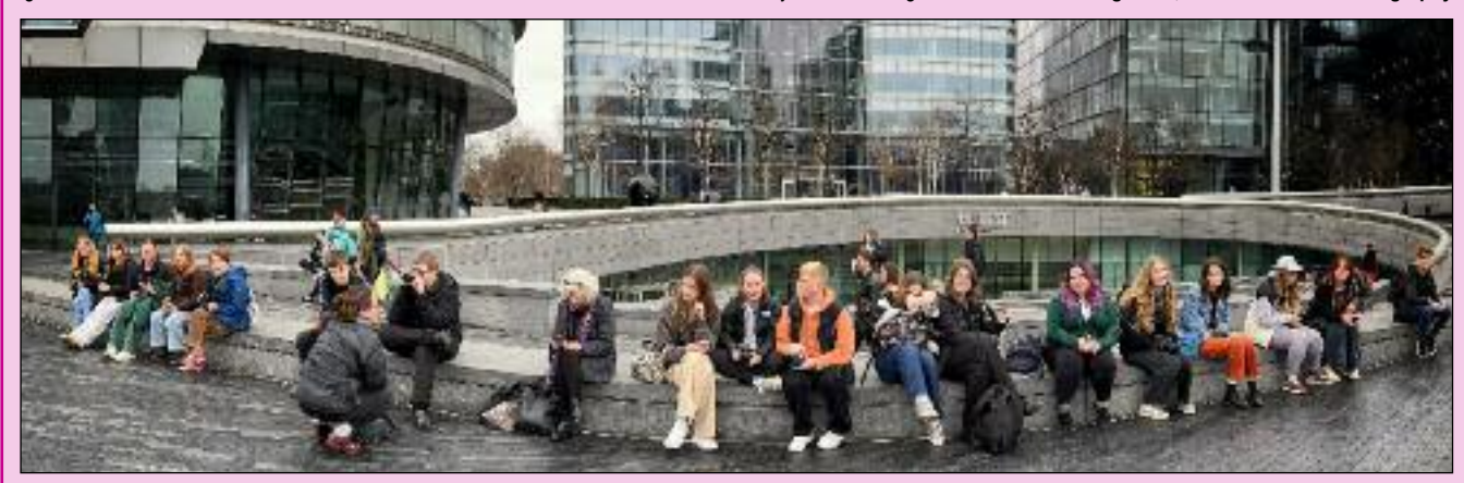
TAKING A BREAK: Students grab a sit-down outside City Hall during their busy weekend in London.