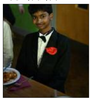
SHARP-DRESSED MAN: At the Year 8 social.