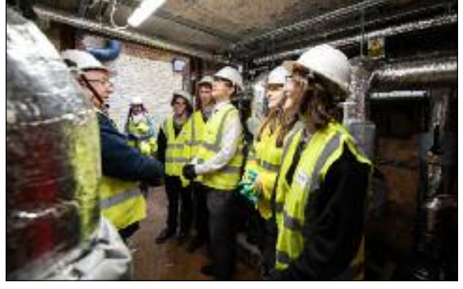
POWER-FUL EDUCATION: Some Year 11 students had a chance to visit the new energy centre and get up close to the rooftop solar panels as the project has been integrated into the curriculum.