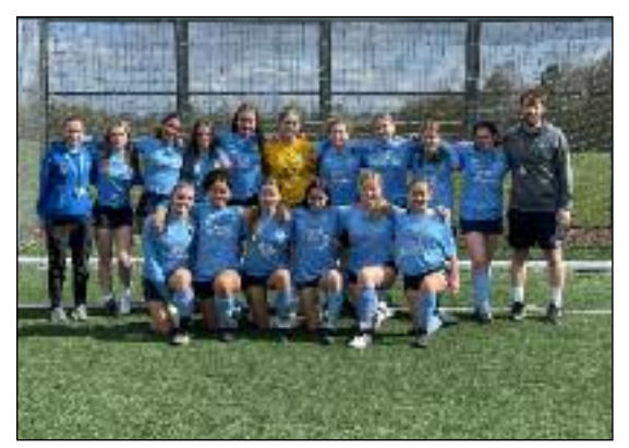
FINALISTS: Comberton's under-16 team.