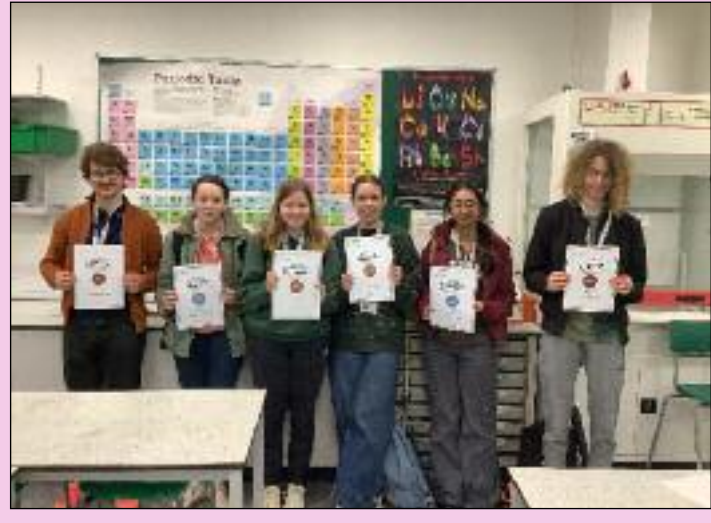
ACHIEVEMENTS: Some of the CSF students who received certificates from the Royal Society of Chemistry Olympiad.