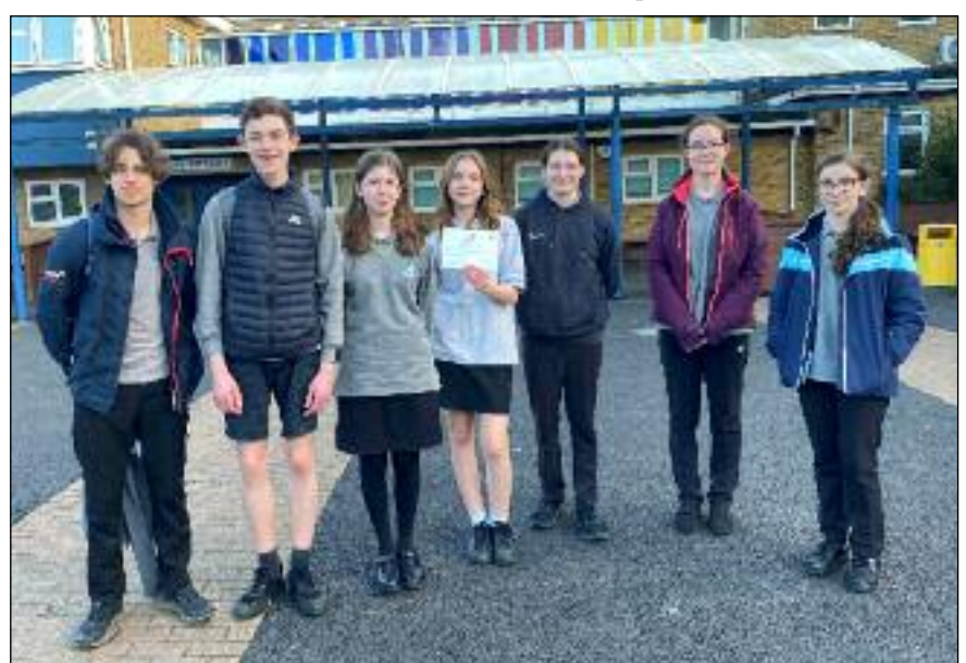
FEAST OF MATHS: Comberton's team after their marathon competition at Linton Village College.

Last week eight of our Year 10 mathematicians travelled to Linton Village College to compete in this year's AMSP 'Maths Feast'.