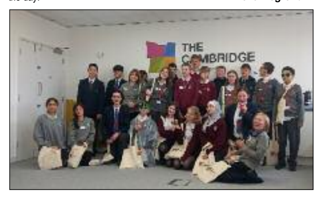
ALL TOGETHER NOW: Students who attended the Launchpad event at the Cambridge Building Society.