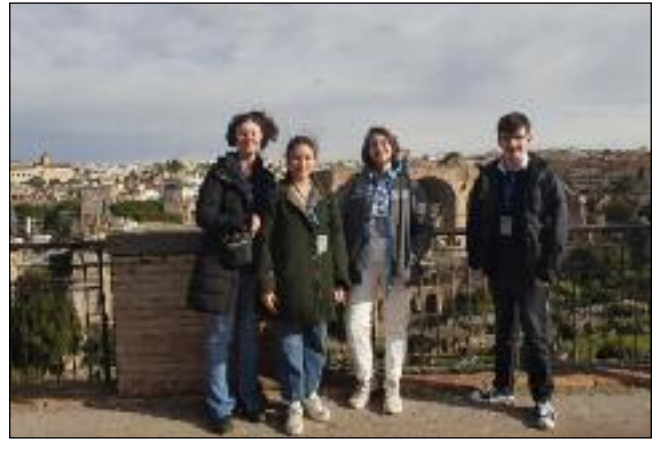
THE WONDERS OF ROME: Students took a walking tour which included many of the most famous sights.