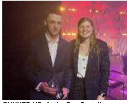
RUNNER-UP: At the Roy Burrell Awards.

He came second in the world at the Junior World Championships in Portugal. He also placed third amateur in the qualifying rounds of The Open Championship, against adult golfers.