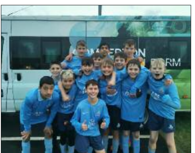
FIFTH ROUND: The Year 8 boys reached the fifth round of the English Schools national competition.