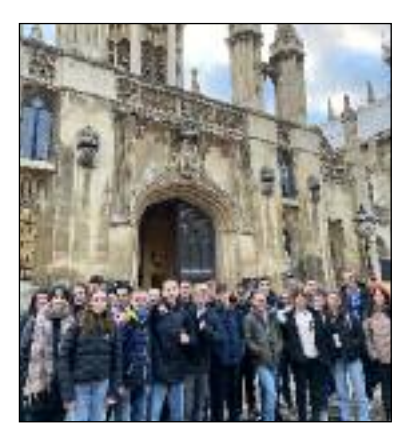
SEEING THE SIGHTS: The German visitors at King's College.

"The final day was the best day, because we took part in a treasure hunt at school and reflected on our week. "It was a great experience, and it was very sad seeing them go. Es war fantastisch!"