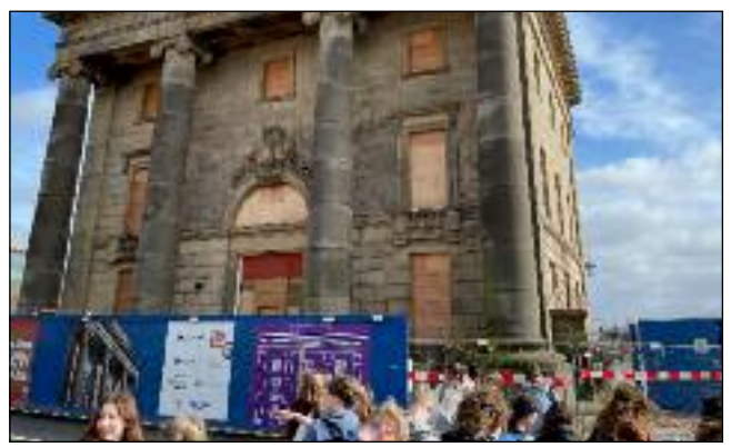
THE CHANGING FACE OF BIRMINGHAM: Students carried out two different surveys in a city undergoing significant regeneration work.