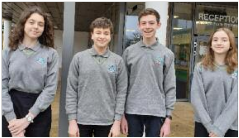
NEW TEAM: The next quartet of head prefects has been chosen from Year 10 applicants.

Choosing the final four for this team was a long conversation and much deliberation was needed. The six not selected were all excellent and will also be very busy as senior prefects leading the other prefect teams."