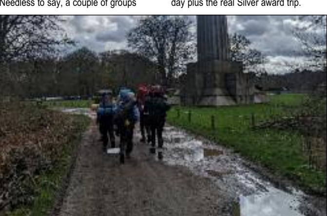
PRACTICE EXPEDITION: Year 10 find out what's required for the Silver Award.

Well done everybody for battling on through the wind and rain. We hope the beautiful countryside made up for it! Fingers crossed the Peak District is kinder to you in the summer. Next term will see two Bronze expeditions, a Gold expedition, a training day plus the real Silver award trip.