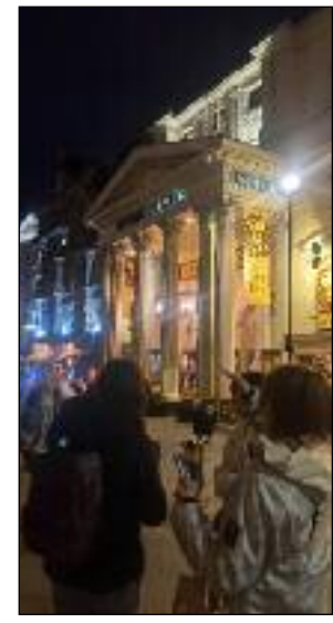
WE'VE ARRIVED: Students head into The Lion King in

We all really enjoyed our school trip to The Lion King and especially London. I hope there will be more trips like these in the future and cannot wait for the next one!