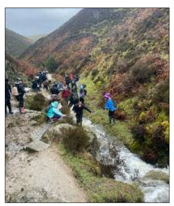
WATERWORKS: Students measure the depth, width and velocity of the river.

Year 11 geographers spent two days in the Midlands looking at the regeneration of Birmingham and collecting data of a river to meet the GCSE specifications of completing one physical and one human geography fieldwork enquiry.